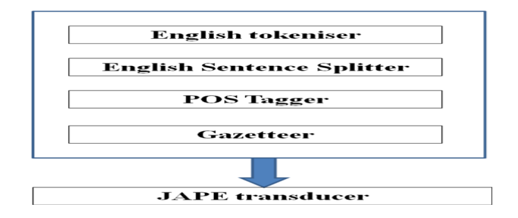
Fig 1.Components of Information Extractor

To support our application we use an agglomeration of pattern rules popularly known as the JAPE grammar. The grammar is divided into two segments that is left side and right side. The annotation pattern that contains regular expression operators (e.g. +,*) should be present on the left hand side of the rule. The statements used to manipulate the annotations and the actions to be taken are specified on the right hand side of the rule. Labels are used in the RHS to reference the annotations matched in the LHS.